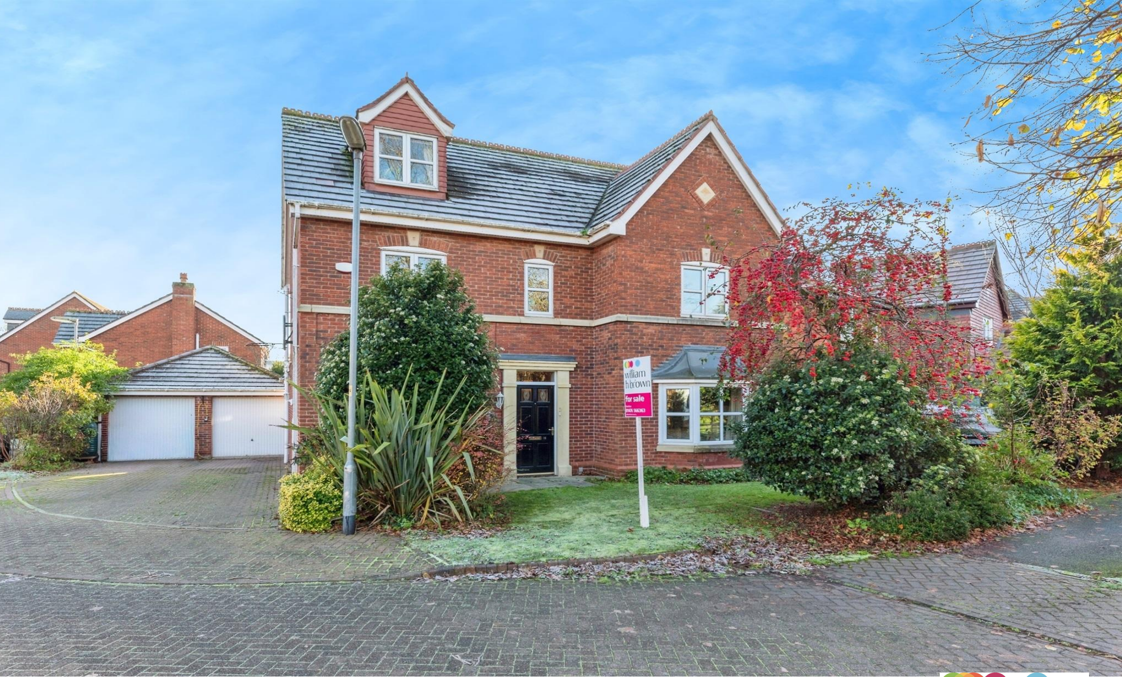
Langford Gardens, Grantham NG31 8DW