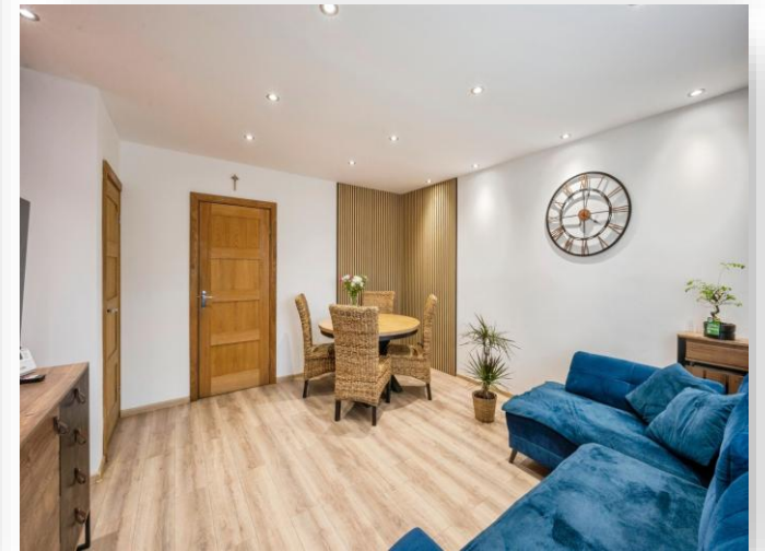
Windhill Crescent, Mexborough S64 0EA