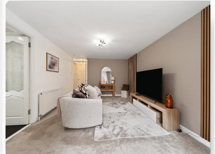
Calderglen Road, East Kilbride GLASGOW G74 2LQ