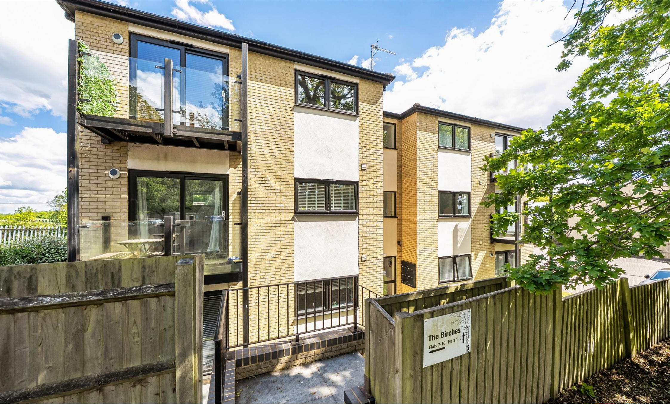
The Birches Sandridge Park, St. Albans AL3 6ER