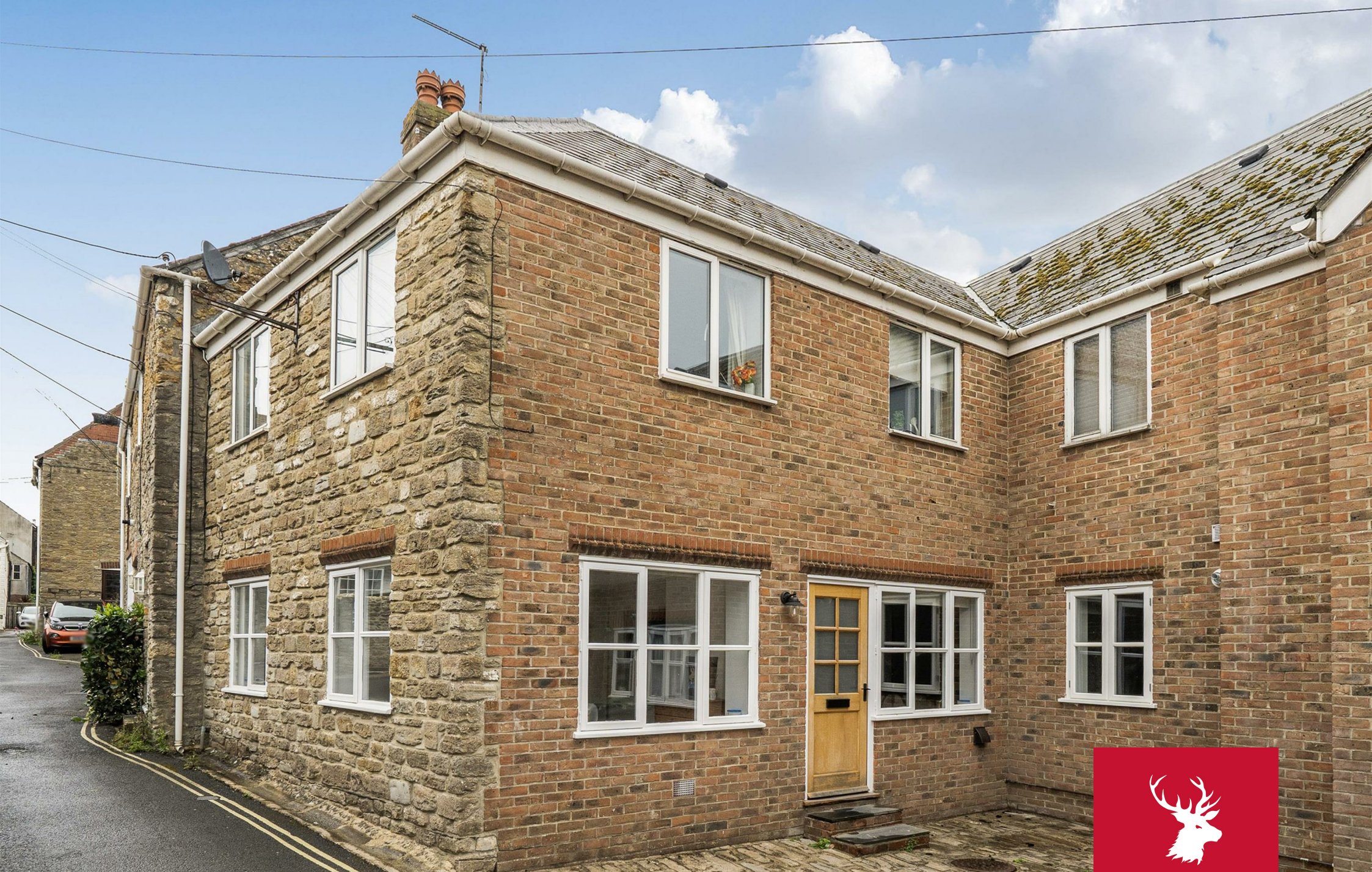
4 Bramley House,