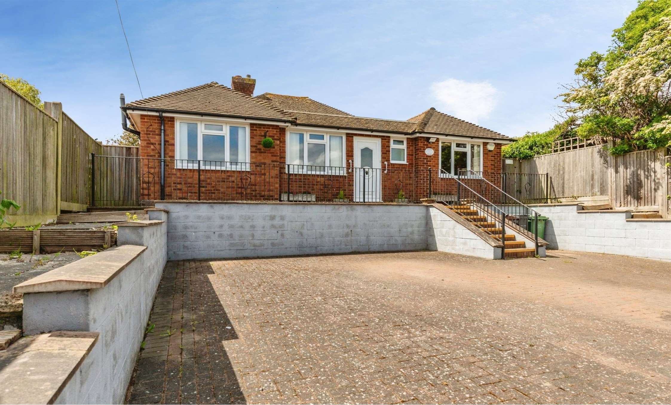
Glyne Bank - Hastings Road, Bexhill-On-Sea TN40 2PU