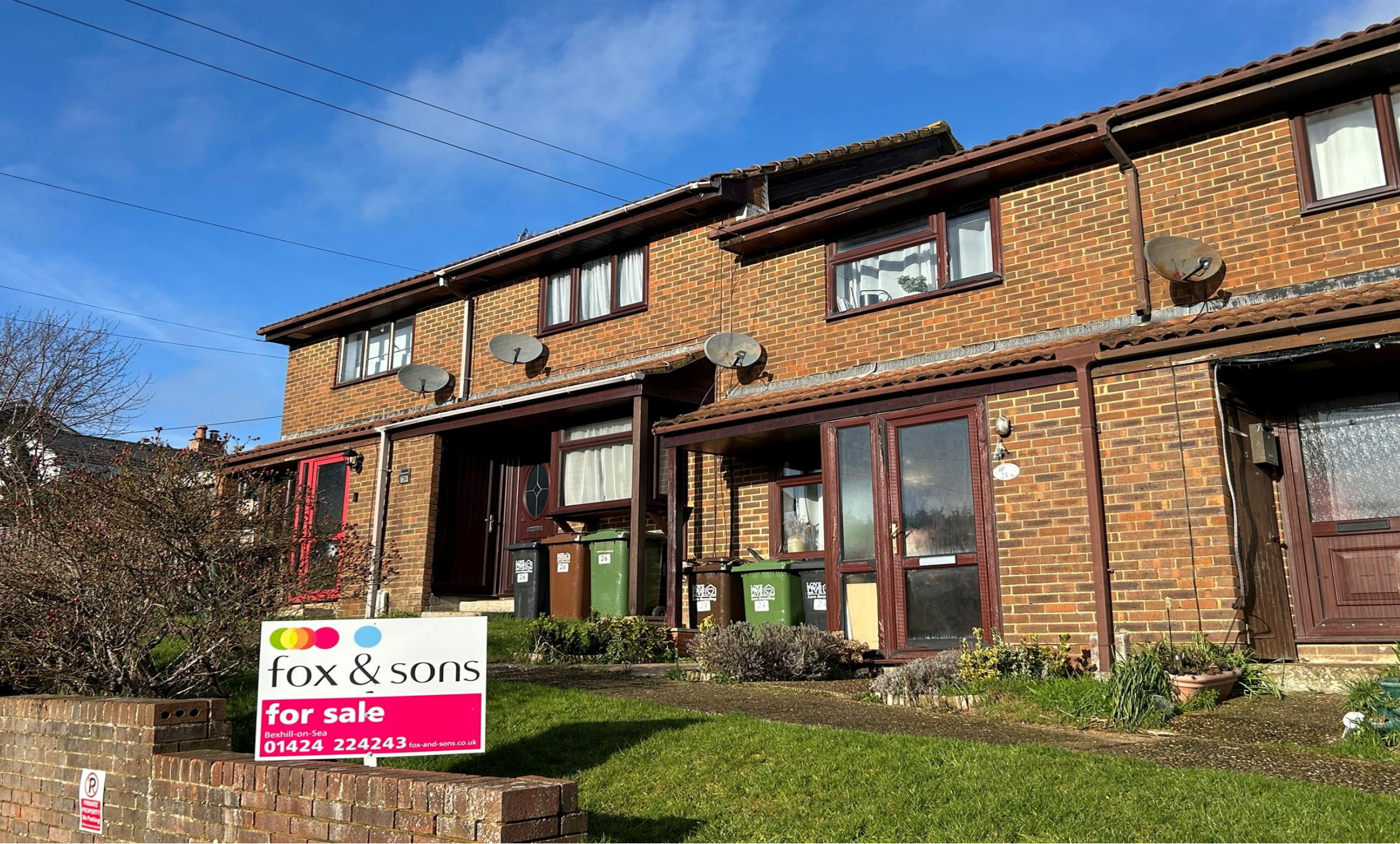
Mistley Close, Bexhill-On-Sea TN40 2TD