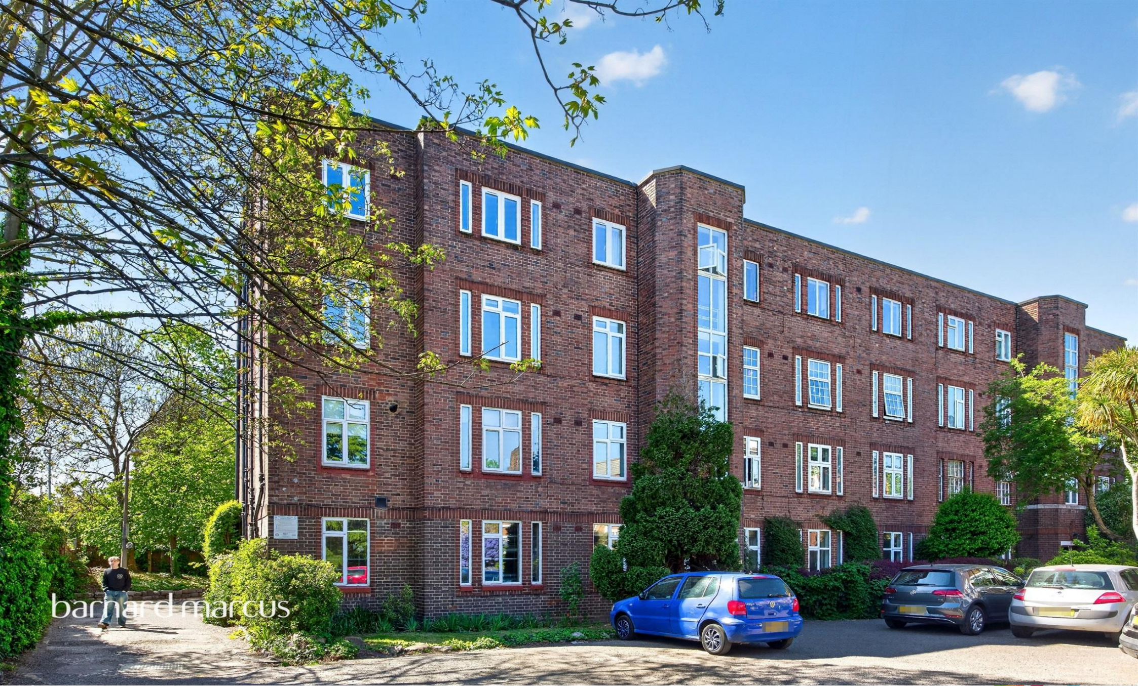
Rosemary Gardens, Mortlake London SW14