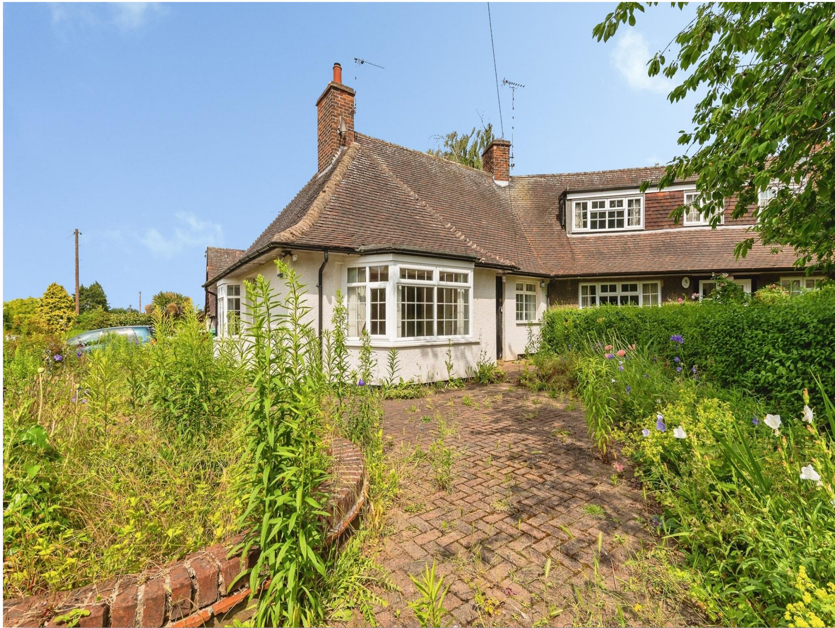
Sutton Passeys Crescent, Nottingham NG8 1BW