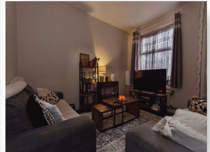
Beach Road, BIRMINGHAM B11 4PL