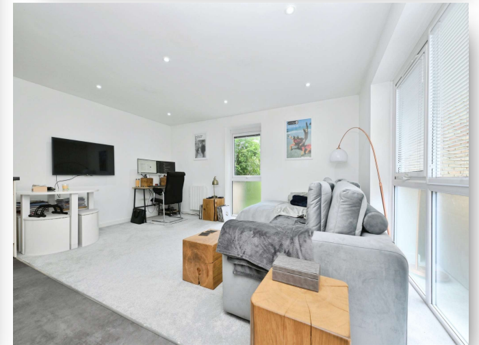
Wells Yard, Ware SG12 9AS