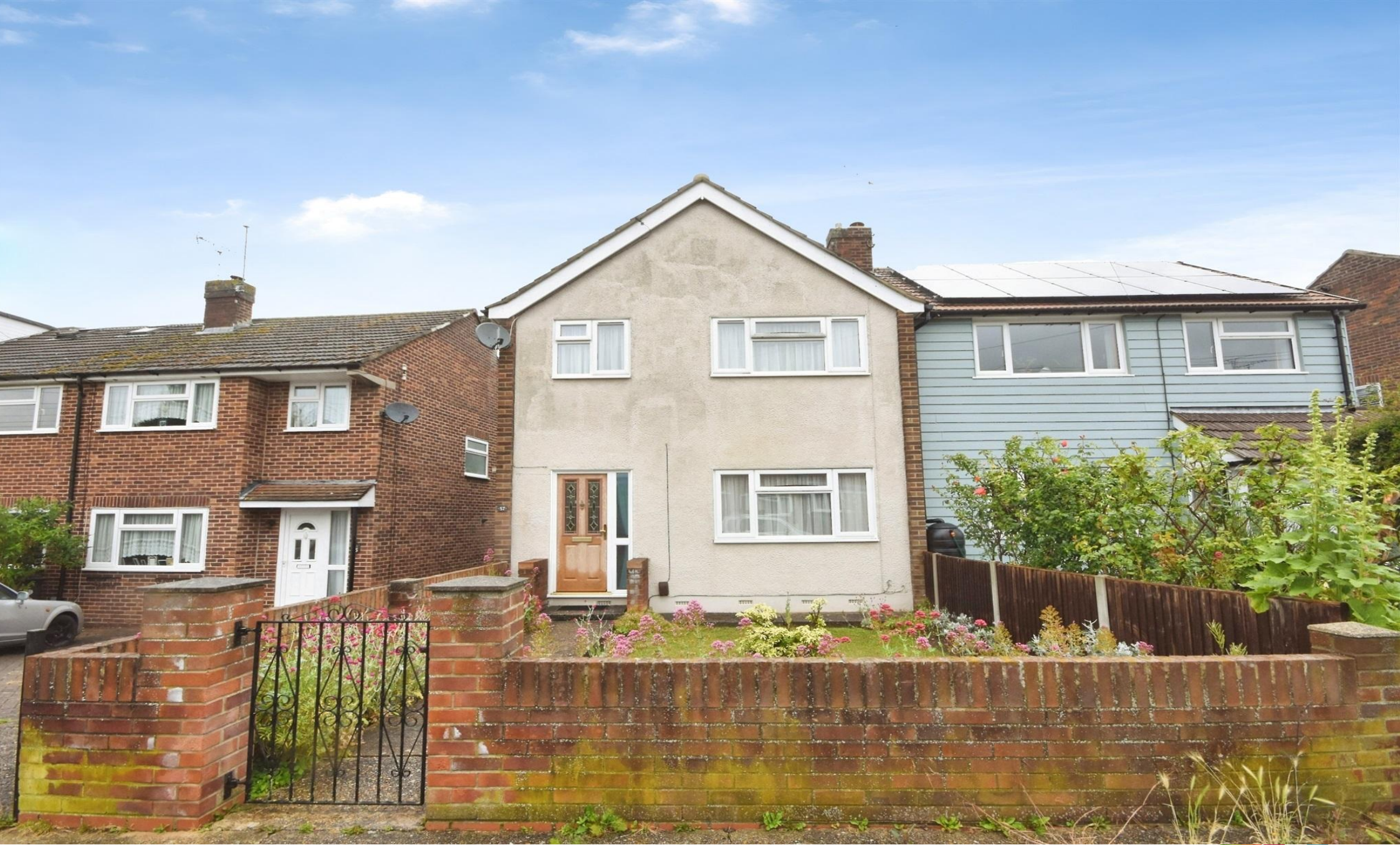
Donald Way, Moulsham Lodge Chelmsford CM2 9JE