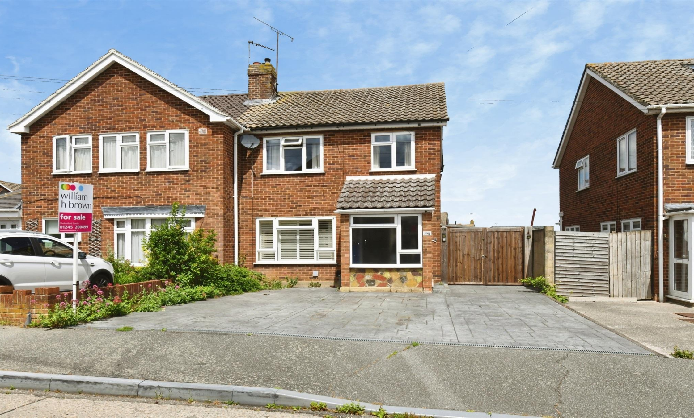
Maple Drive, Moulsham Lodge Chelmsford CM2 9HR