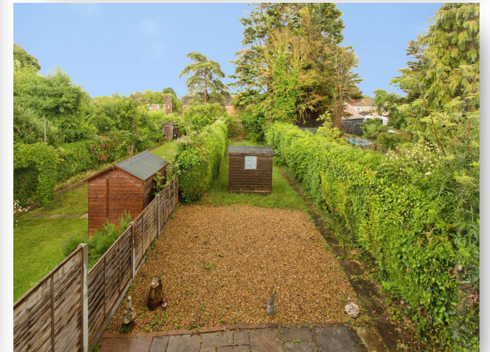
11 Gunhild Close, Cambridge, CB1 8RD