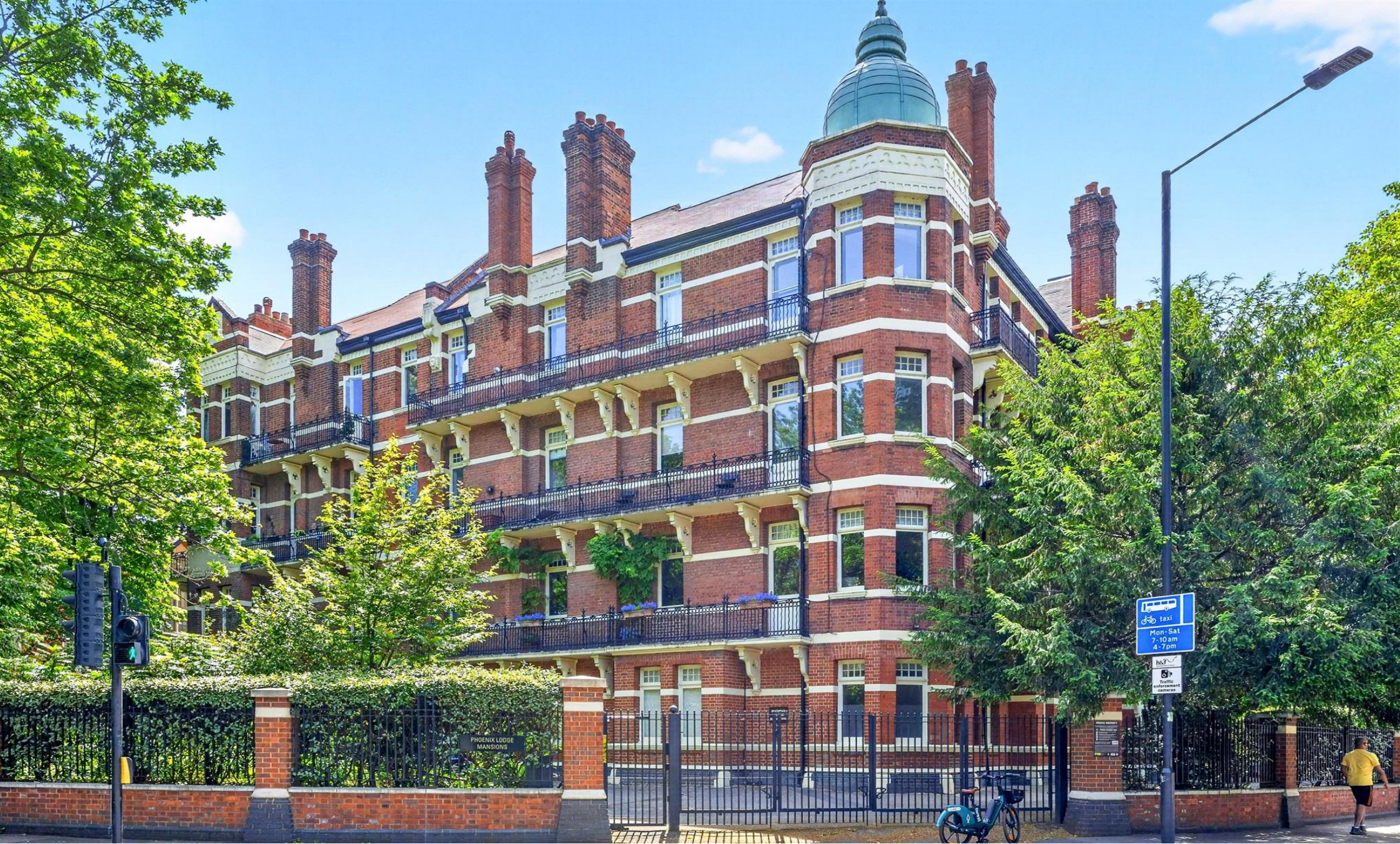
Phoenix Lodge, Mansions Brook Green, London, W6 7BG