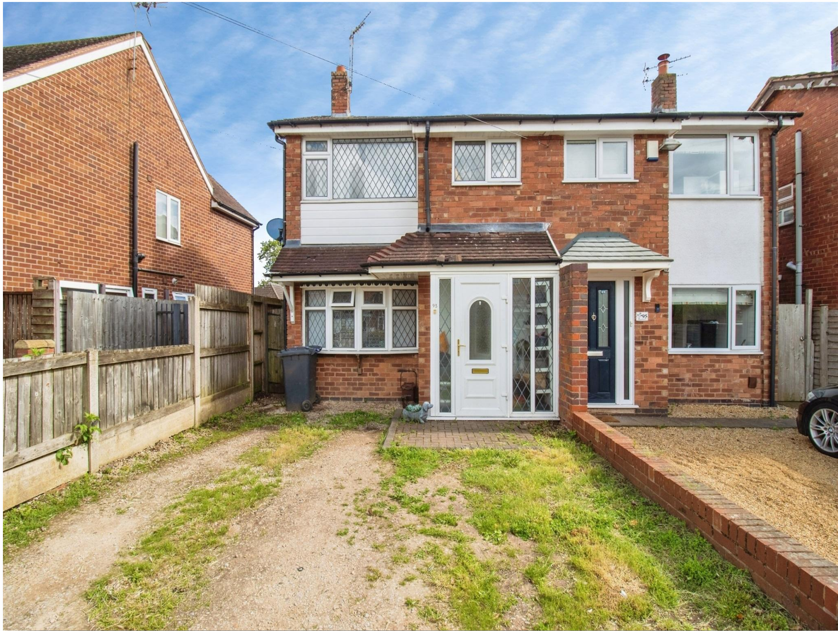
Hazel Grove, Wombourne WOLVERHAMPTON WV5 9EH