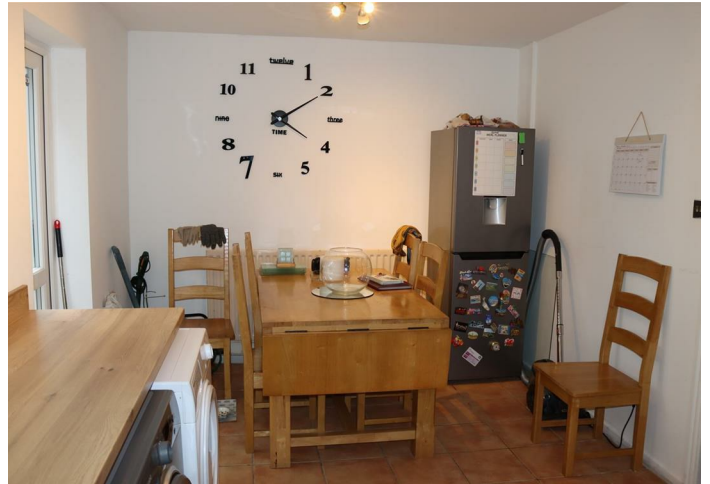
Modern Fitted Dining/Kitchen