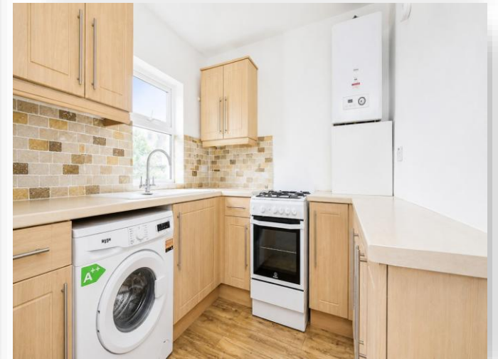
Bullar Road, Southampton SO18 1GS