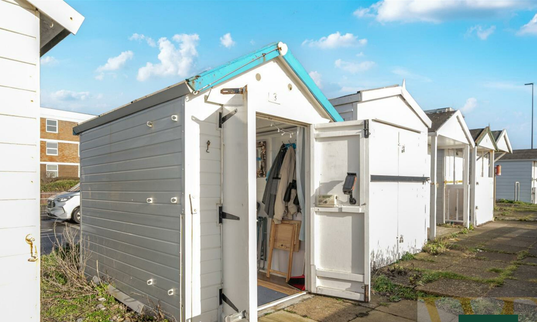
Beach Hut 5, Brooklands Brighton Road | | Lancing | BN15