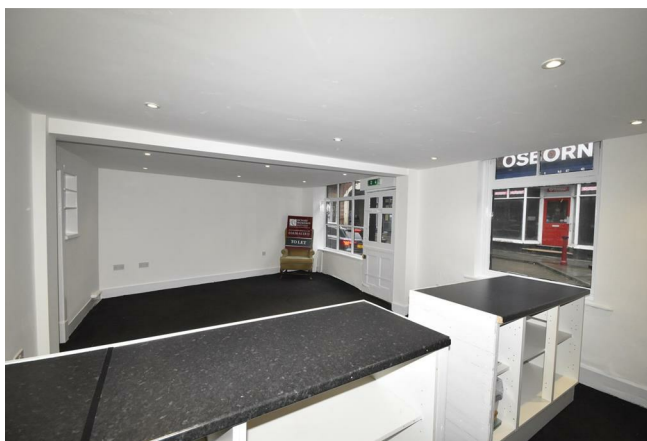
Ornamental brick fireplace opening, LED lighting, display window, centre entrance door and window.