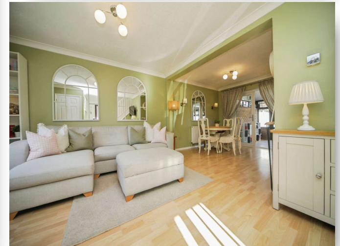
Spencer Way, Stowmarket, IP14 1UB