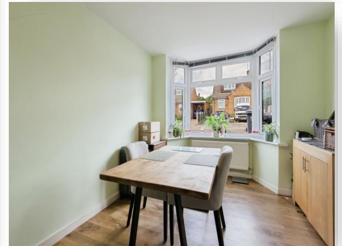
Templar Drive, Northampton NN2 8HS