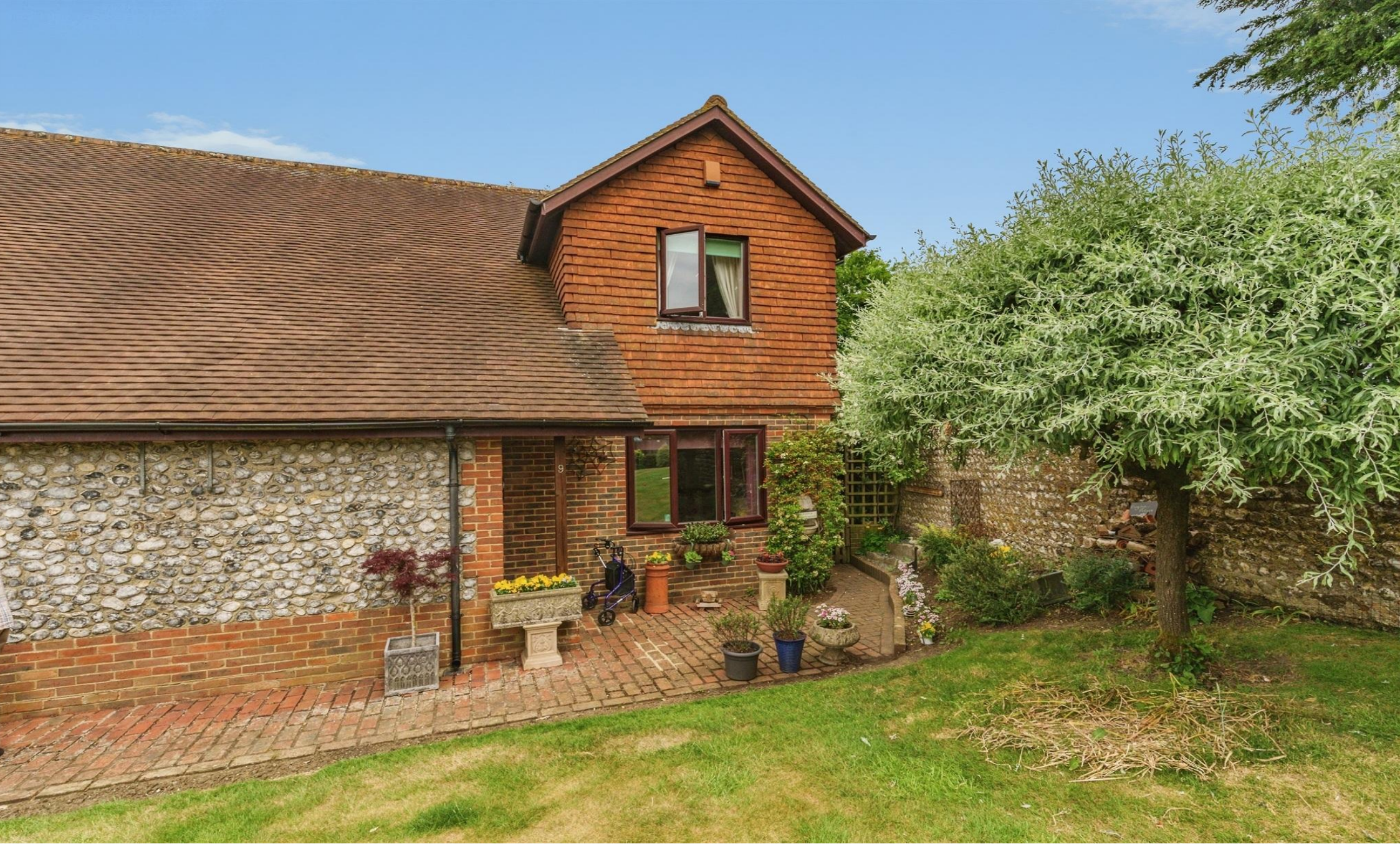
The Courtyard South Street, Falmer Brighton BN1 9PQ