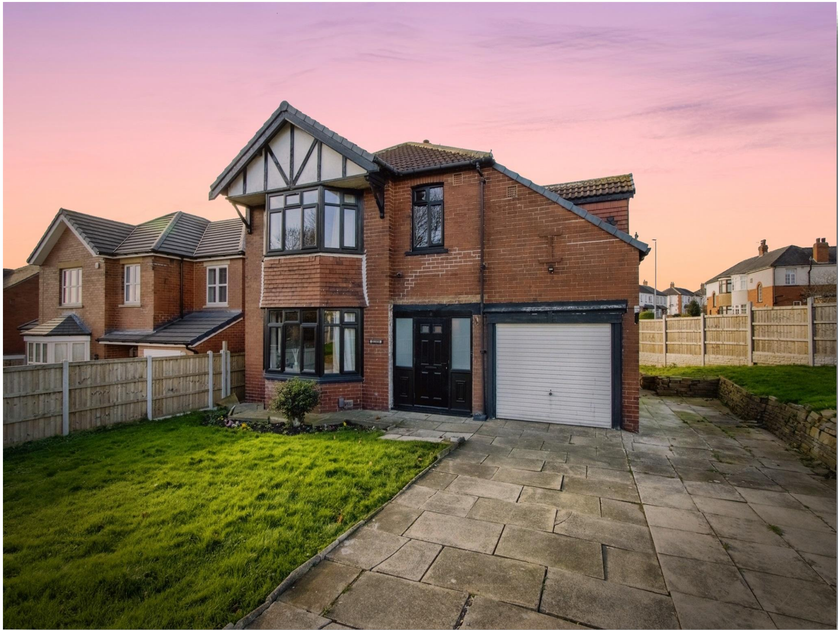
Templensam Road, Leeds LS15 0DR