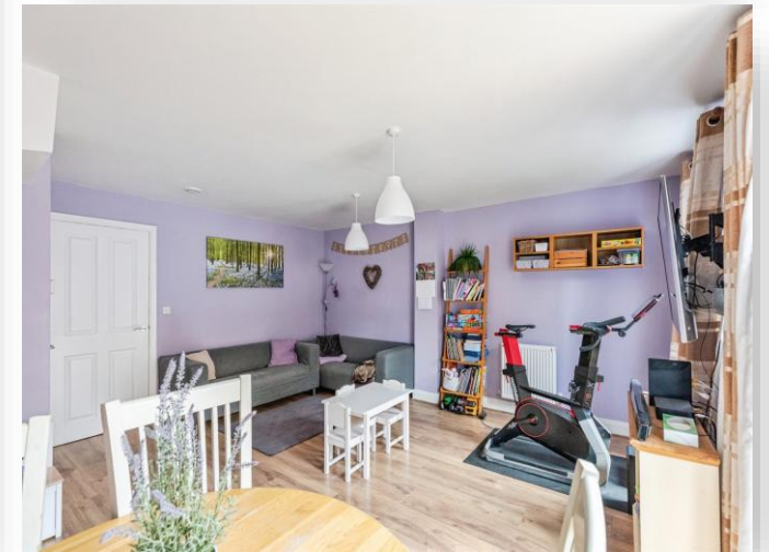
Knot Tiers Drive, Upton, Northampton NN5 4AY