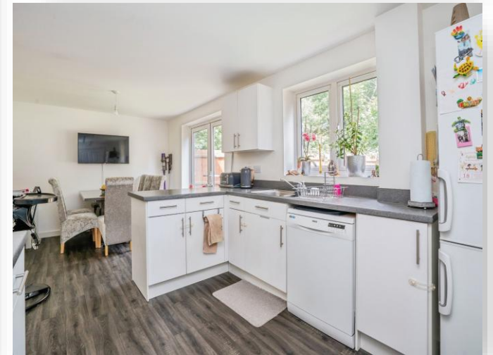
Taylor Close, Waterlooville PO7 5GE