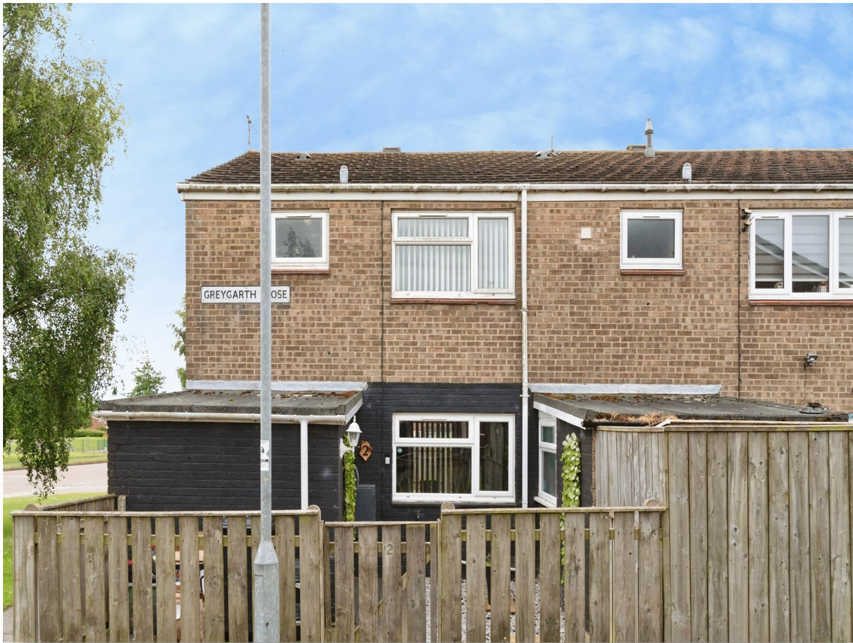
Greycarth Close, Bransholme, Hull, HU7 5AP