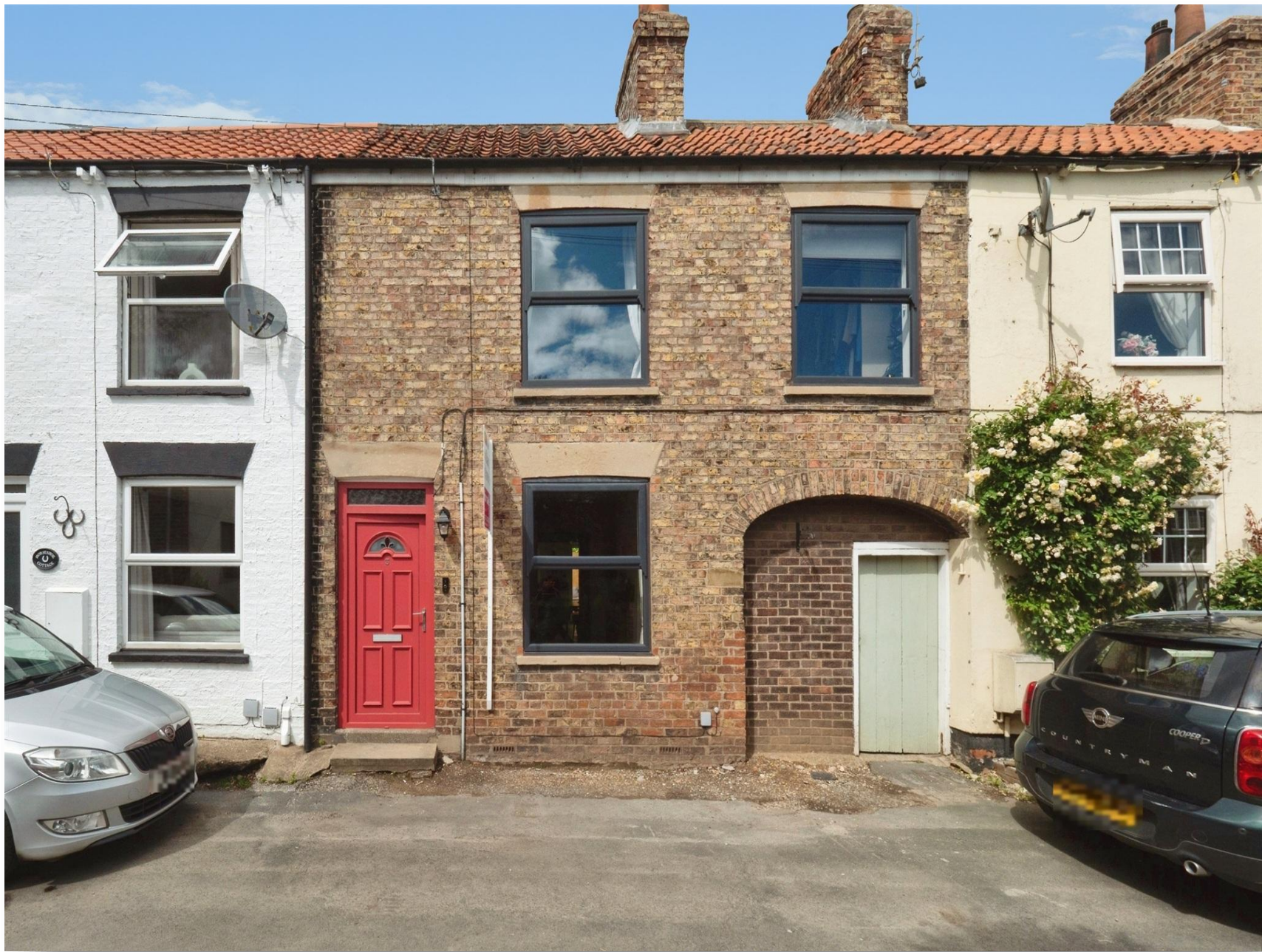
Stockwell Lane, Brandesburton, Driffield, YO25 8RP