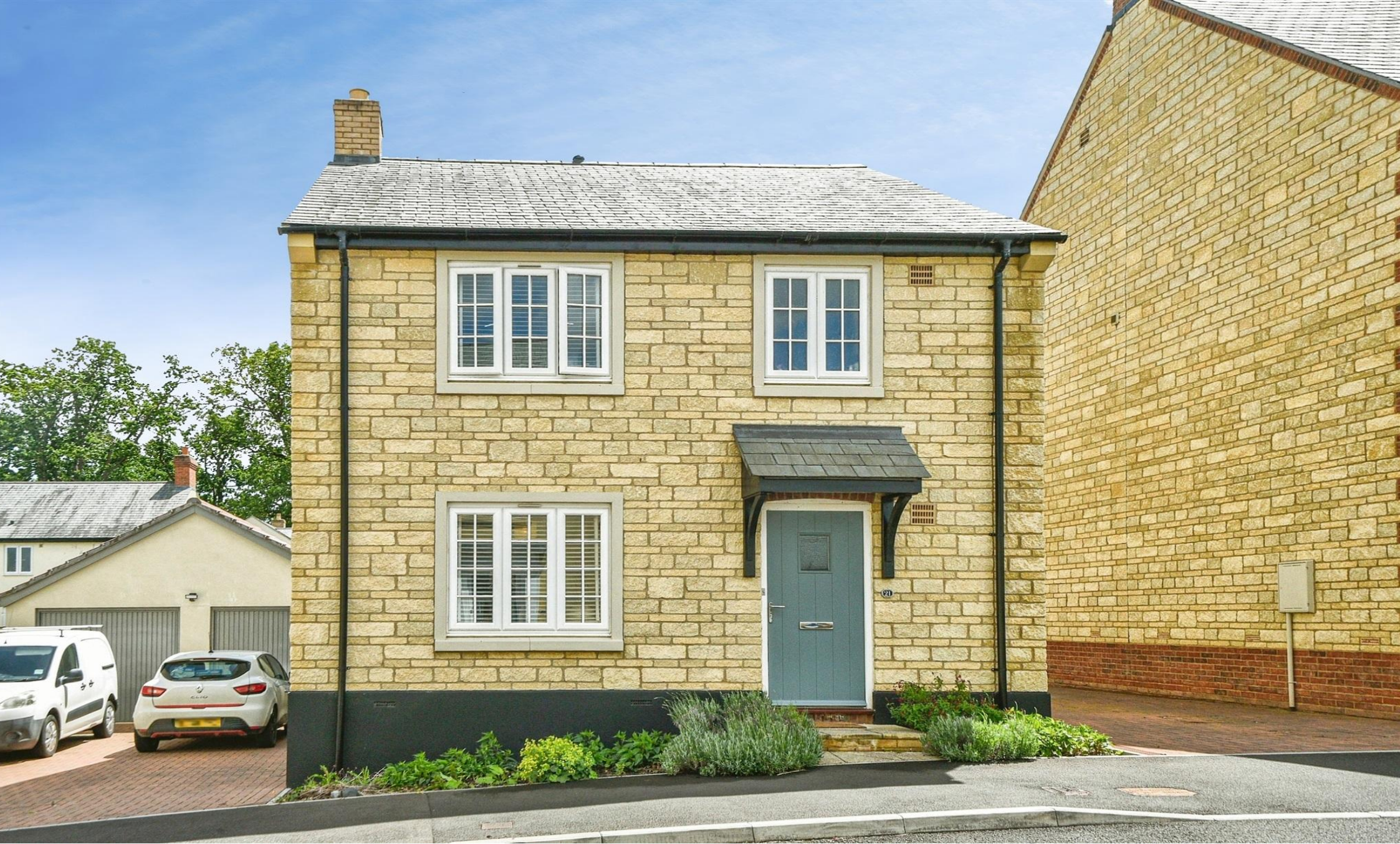
Stoke Meadow, Calne SN11 0FU