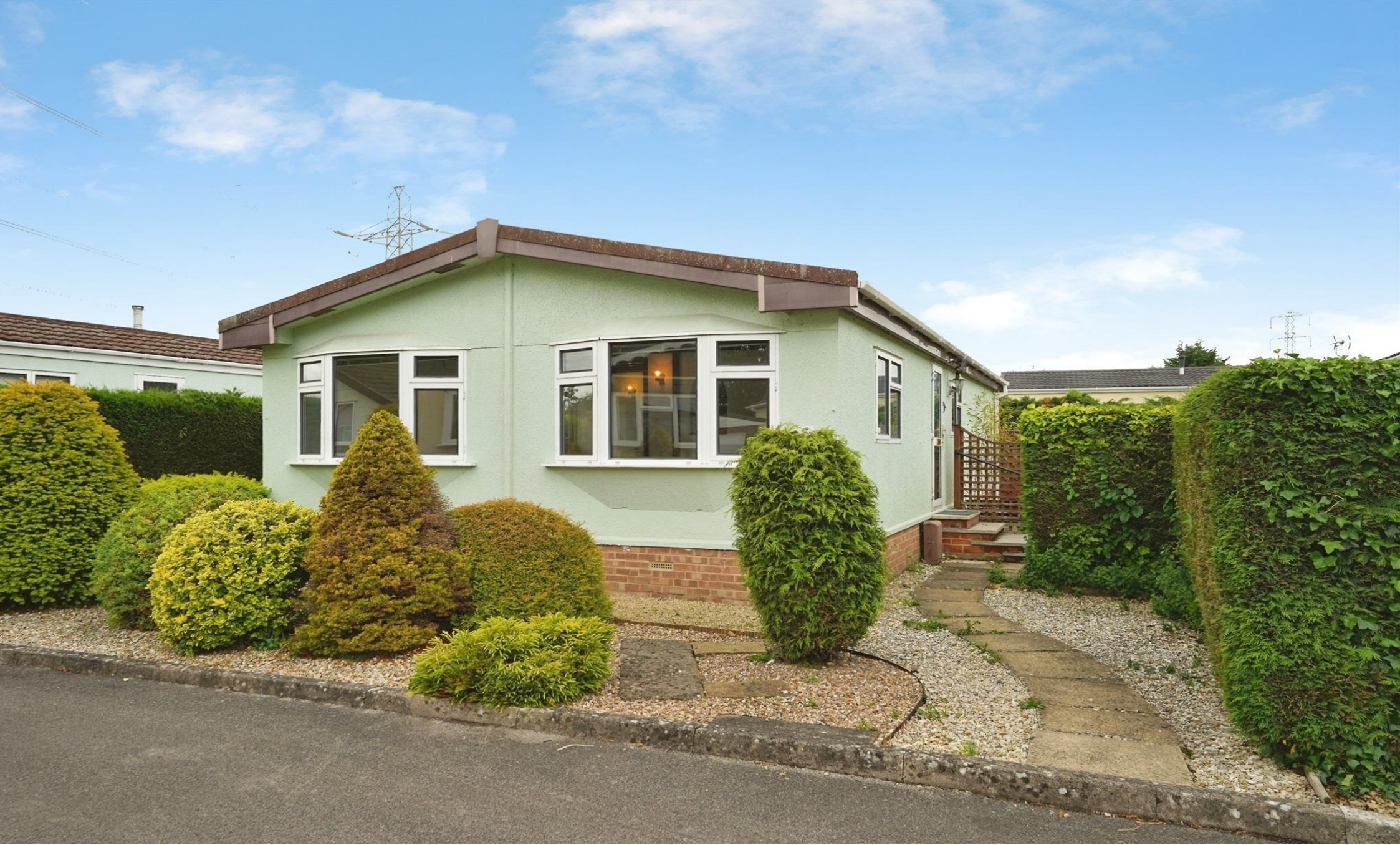
The Glade, Wildwood Park CIRENCESTER GL7 1LY