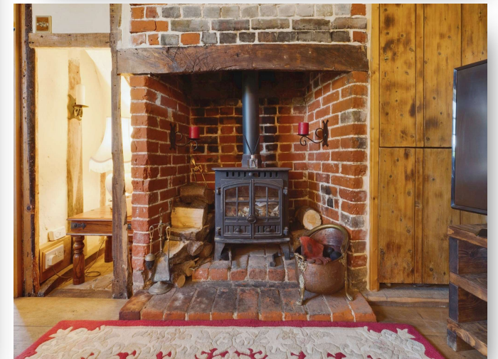
Farfield Brown Street, Old Newton, Stowmarket, IP14 4PY