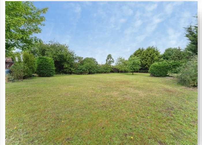
Station Road, Lakenheath, Brandon, IP27 9JB