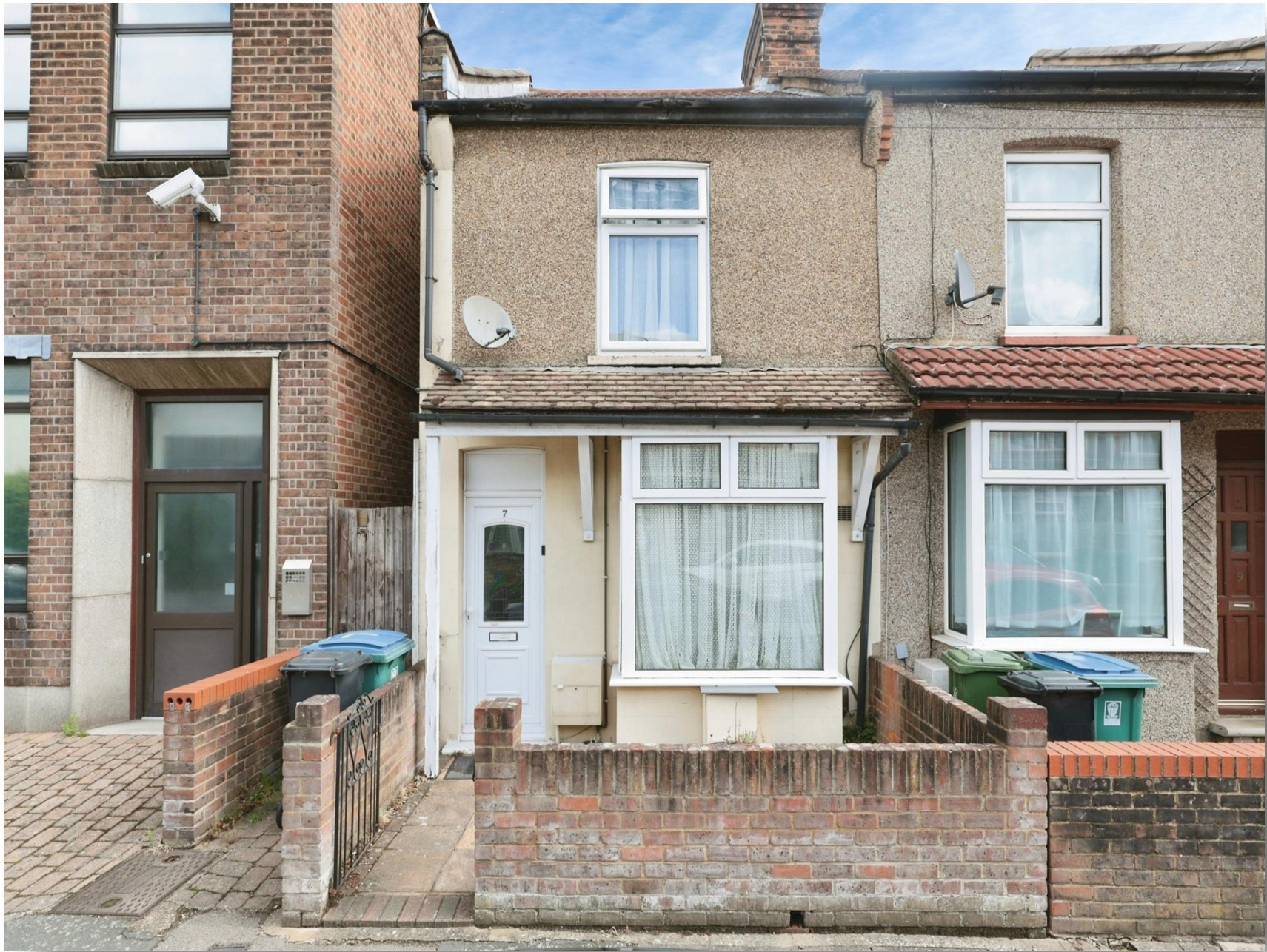
Brixton Road, Watford, WD24 4DX