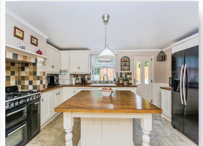
Elm Road, Wisbech PE13 2TB