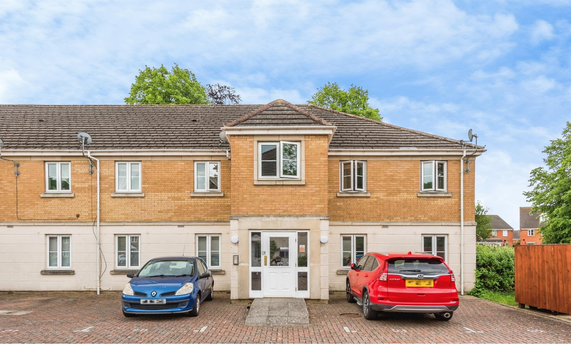
Winton Road, Swindon SN3 4XL

Not for marketing purposes. INTERNAL USE ONLY