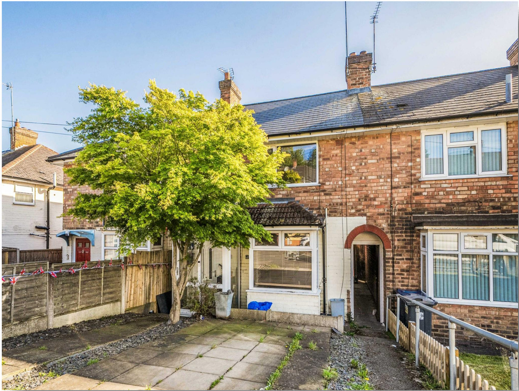
Parkeston Crescent, Birmingham B44 0PE