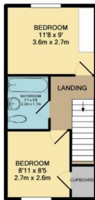
1ST FLOOR APPROX. FLOOR AREA 291 SQ.FT. (27.0 SQ.M.)

TOTAL APPROX. FLOOR AREA 581 SQ.FT. (54.0 SQ.M.)