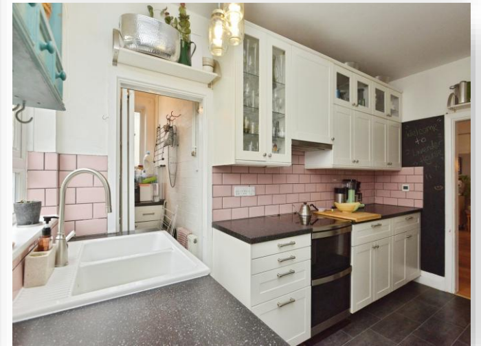
Frankston Avenue, Stony Stratford Milton Keynes MK11 1DR