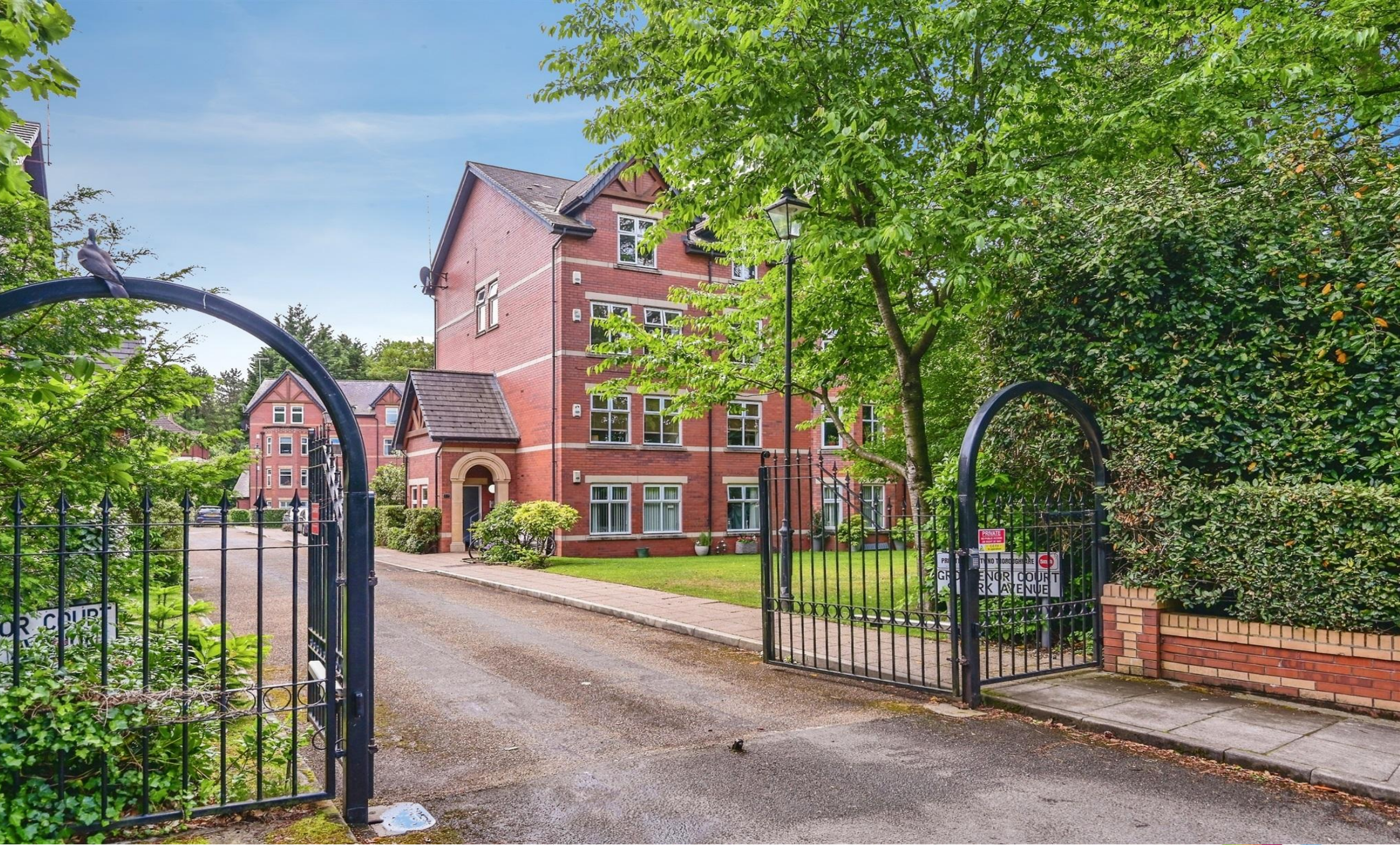
Grosvenor Court Park Avenue, Mossley Hill Liverpool L18 8EU