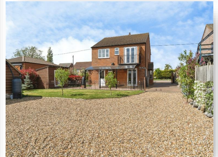
Station Road, Manea PE15 0HG