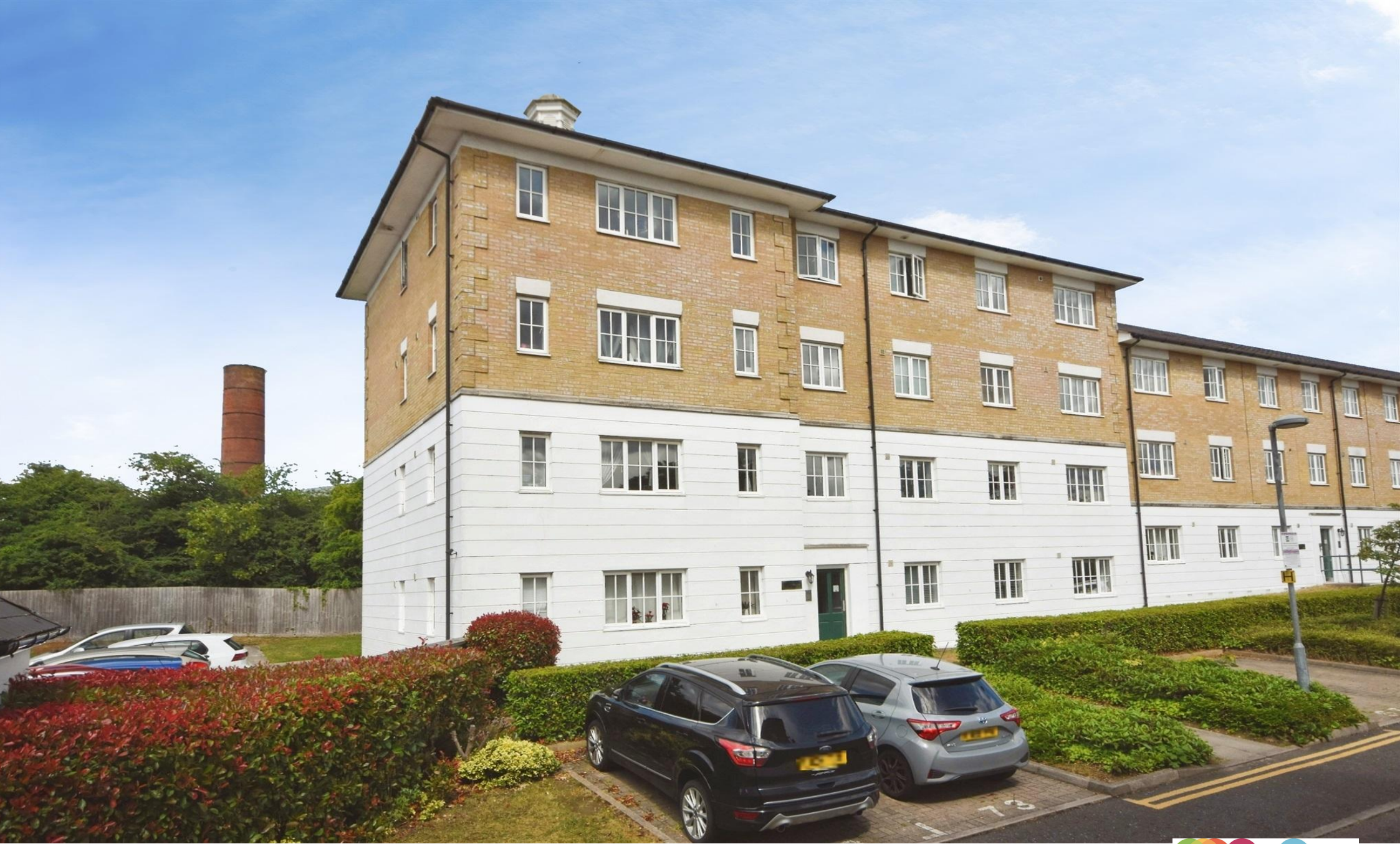
The Yard, Braintree, CM7 3TY