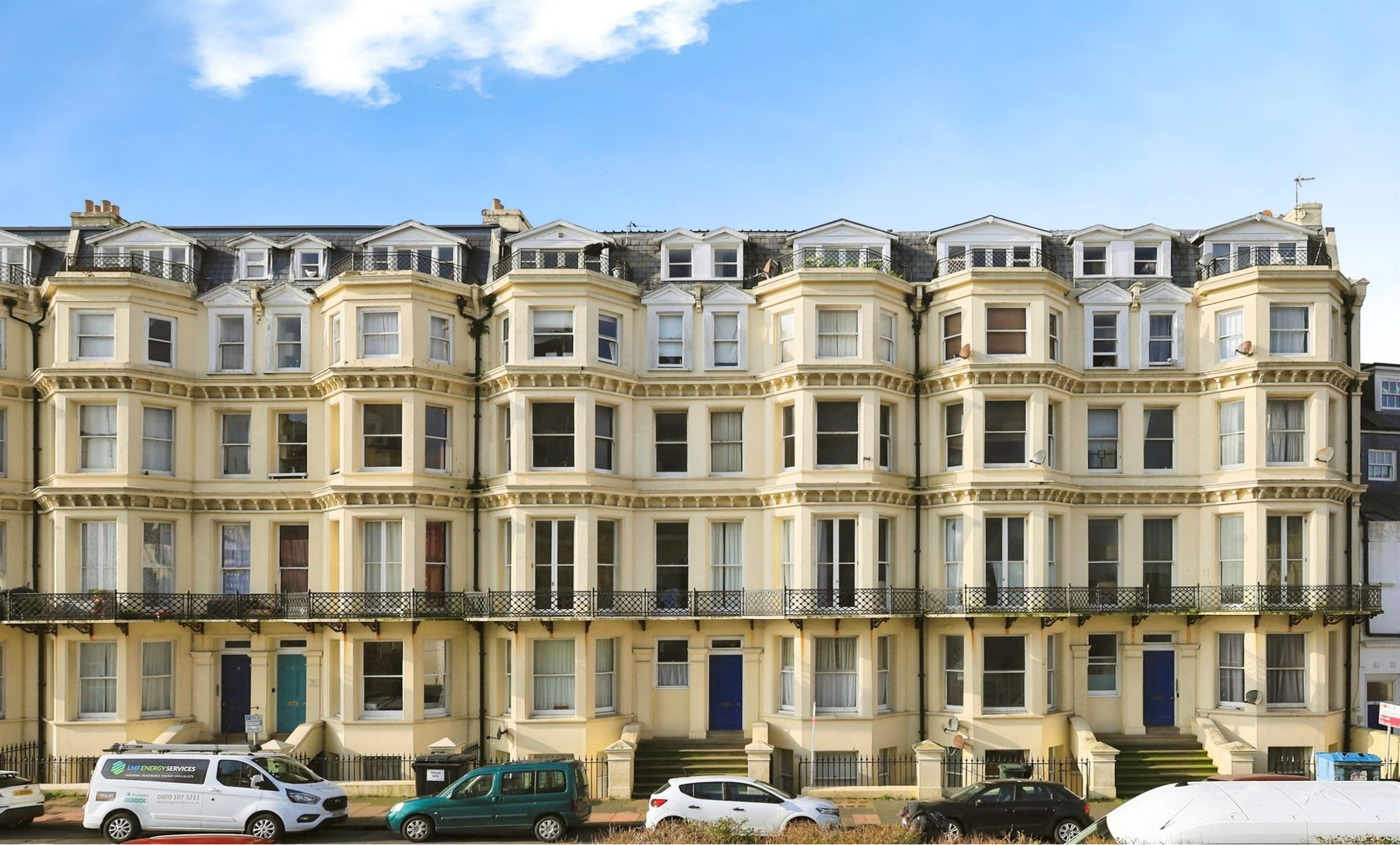
Queens Gardens, Eastbourne BN21 3EF