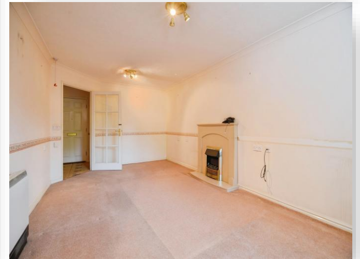
Constantine Court, Linthorpe Road, Middlesbrough TS1 3GA