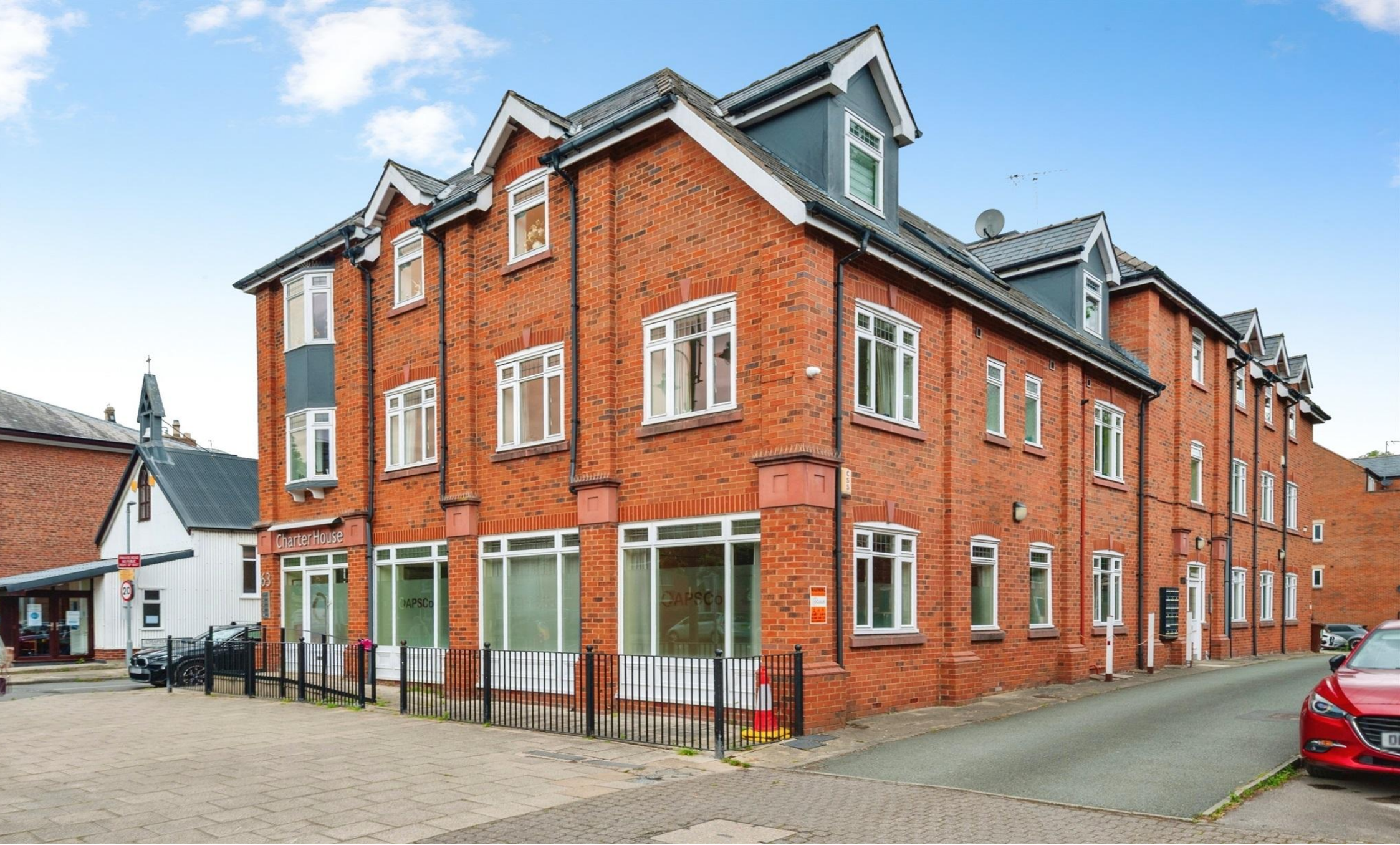
Hillview House Main Street, Frodsham WA6 7DF