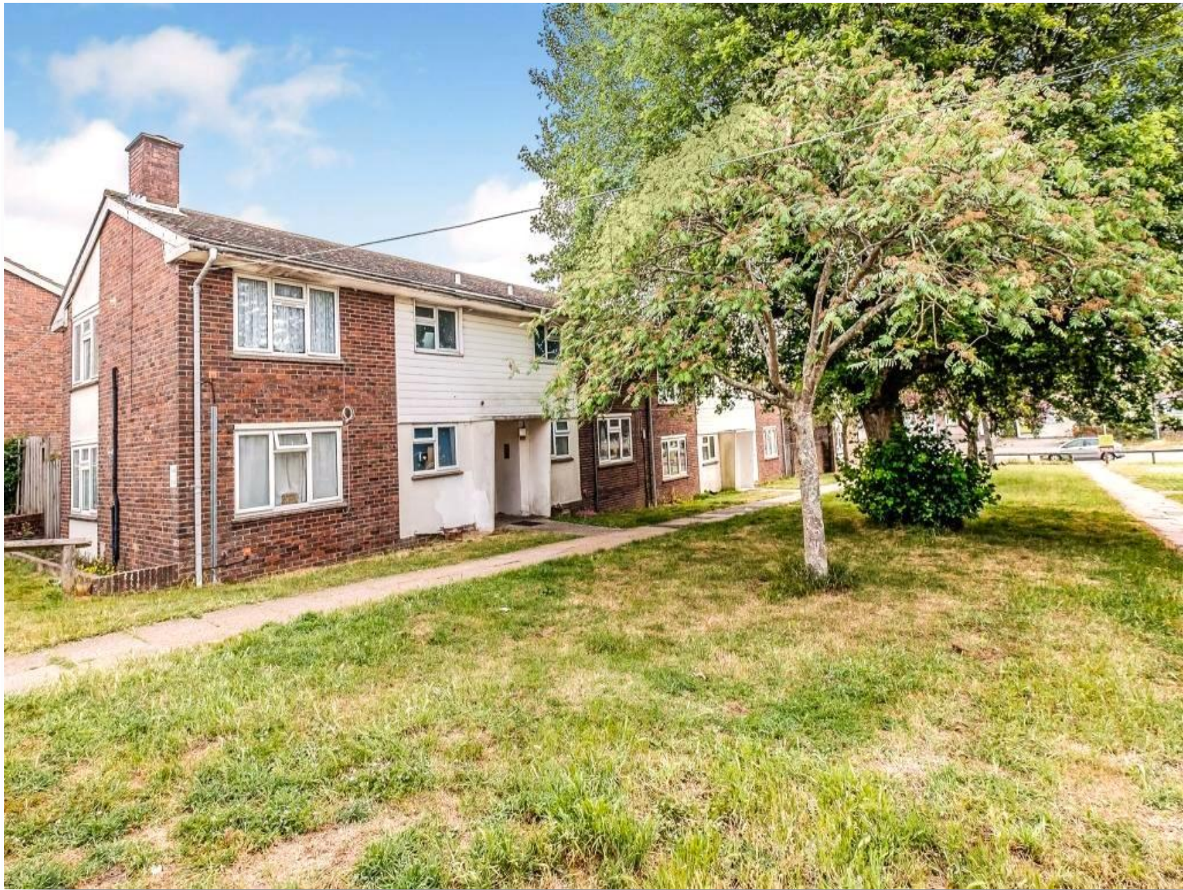
Millfield, Sompting Lancing BN15 0DW