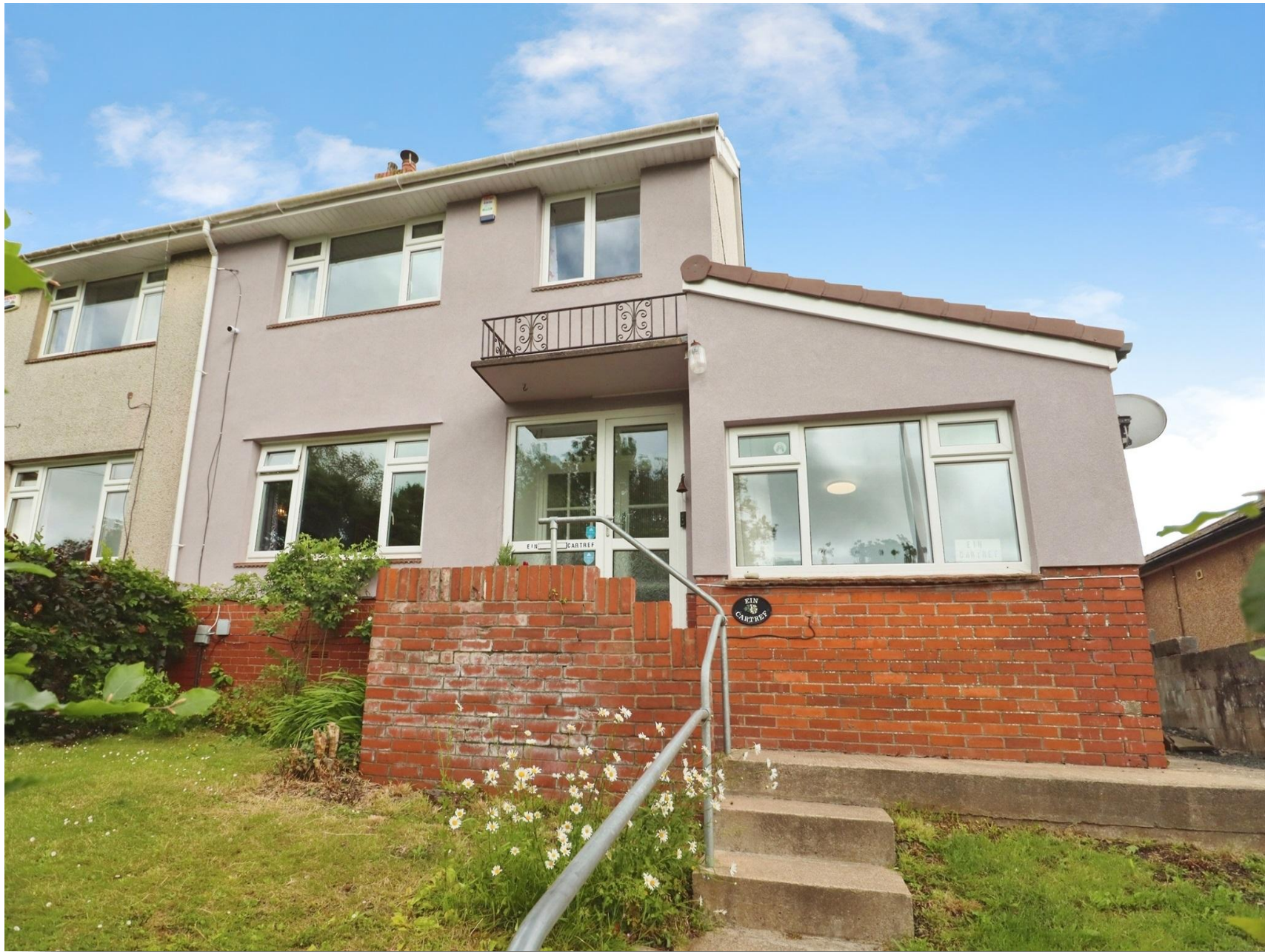
Eincartref Claude Road West, Barry CF62 7JG