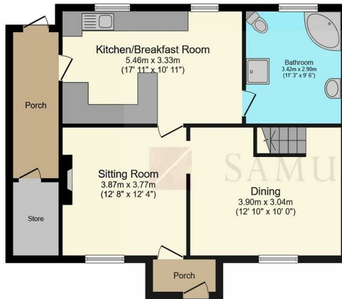
Ground Floor Floor area 75.1 sq.m. (808 sq.ft.)