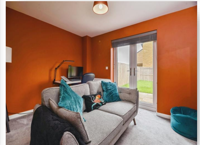
Ash Brook Lane, Hurworth Moor Darlington DL2 1RQ