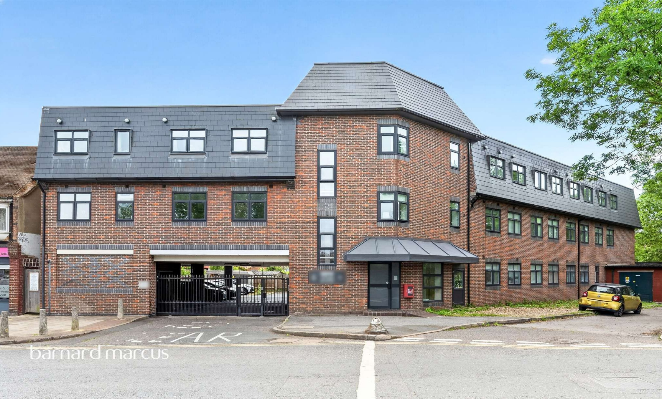
Parkgate House, West Barnes Lane, New Malden, KT3 6NB