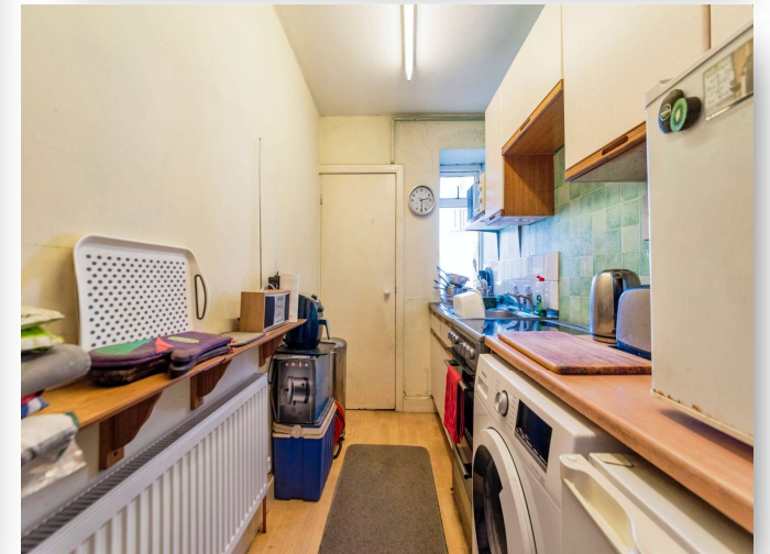
Portland Court, Newark NG24 4XQ